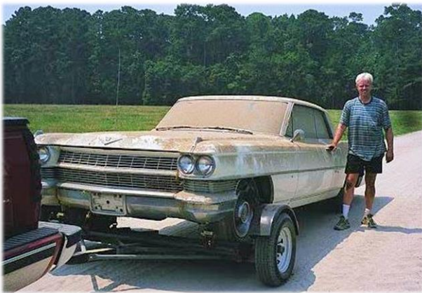
Parts Car from Hertford, NC on July 5, 1999

The idea of bringing in parts cars, dismantling and putting the parts up in dry storage was formed early when I started trying to locate parts for my 1964 Coupe DeVille. I had reluctantly bought the antenna mast for $99 from one of the well-known parts suppliers and determined I could bring in a parts car for a few hundred dollars. Like everything else I did not go about this endeavor half-hearted and had amassed a large collection of parts within a couple of years. It would be easy for me to fill pages about the parts business but will leave that story for another day. This endeavor has been a great source of