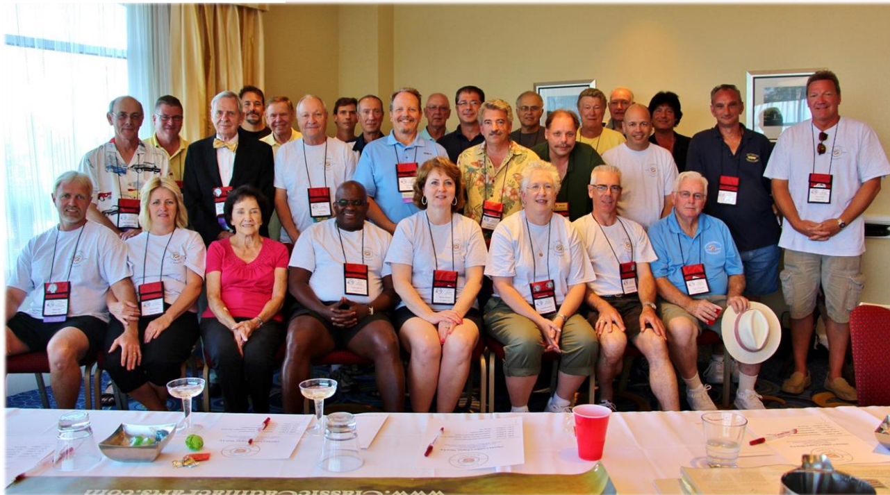
1963/64 Cadillac Chapter Grand National Meet Up August 3, 2013 at Boston Marriott Quincy hotel