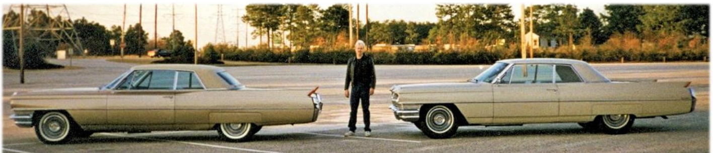
Another Picture from Feb 16, 1997 between my Gold and Bahama Sand 1964 Cadillacs