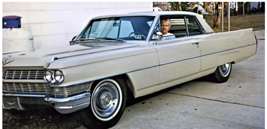
The picture above was taken on November 13, 1996. The was the same day I bought my 1964 Coupe DeVille and had proudly driven it down to my dad's in Fayetteville, NC to show off my Cadillac. My relationship with Cadillac was born!!

Being a lifelong Elvis fan, I had always thought about owning a 1950's Cadillac and started looking around about the same time we bought the house. Again as fate would have it, we saw an ad for a 1964 Coupe Deville in the local paper and took it for a test drive. We titled the car the very next day on November 13, 1996.