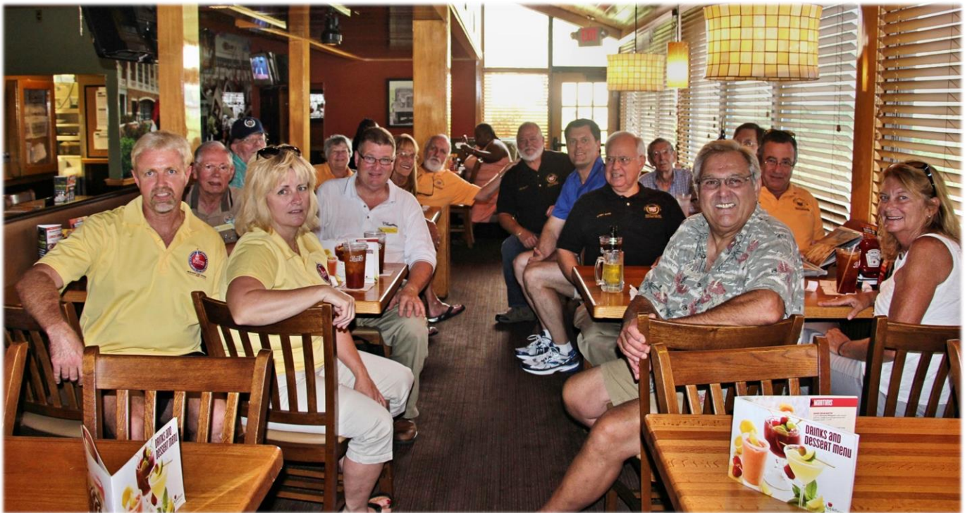
Joint Eastern North Carolina and Carolina Region Meet-Up August 31, 2013 at Applebee's in Burlington, NC