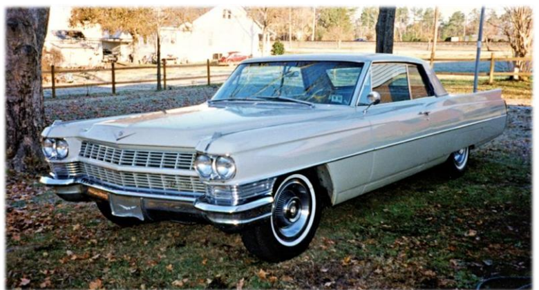
Pictures Taken Late November, 1996 – Note There is No Garage to House my "New Cadillac"!