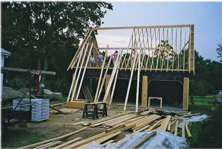
3 Bay Garage Going Up – July 1999

parts for my 1964 Coupe DeVille and has been a fantastic learning experience in terms of knowing how these cars are put together....and how they come apart!