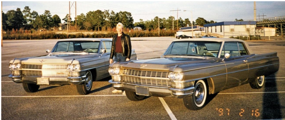
Picture from February 16, 1997 – 1964 Coupe DeVille on Left and 1964 Series 62 Coupe on Right

As is my nature, when I make that decision to pursue a new interest, I do not go about it half-heartedly. Within a couple months I had purchased a 1964 Series 62 Coupe, and had marched into the Spring 1997 Carolina Collector Auto Fest in Raleigh, NC and asked “Where is the Cadillac Club? I want to join!” As I am always struggling to get “Cadillac Enthusiasts” to join the Cadillac LaSalle Club, I always think fondly back to my first days walking around asking people where the Cadillac Club is. I was probably the easiest member the CLC ever recruited!