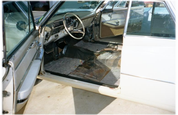
New Carpet was one of my Early Upgrades

Some of the early upgrades I made to my Coupe DeVille were simple things such as replacing broken parts, carpet and torn seat fabric, and taking care of basic maintenance. I did drop a valve shortly after buying the car. After an interesting experience with a local mechanic deemed as an “expert on old cars”, I ended up having the car towed back home where I removed the heads, had our local machine shop rebuild, and I reinstalled them. The cylinder head rebuild would save me money down the line when it was time to rebuild the bottom end.