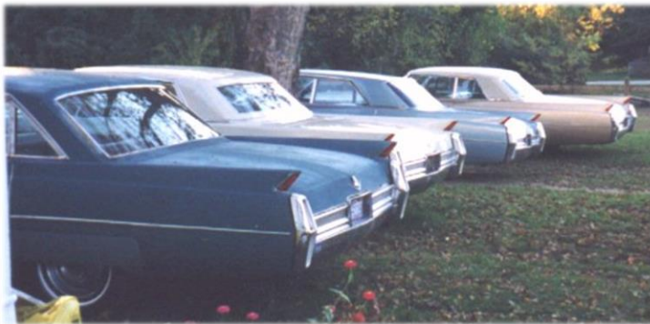
The 64 Cadillacs Quickly Multiplied

Within a couple of years I had started bringing in additional driver cars and several parts cars. Our 84 year old house did not have a garage and I was resigned to using car covers until a better solution presented itself. During the first couple of years I actually stored most of my extra parts in my mom’s basement just down the road.